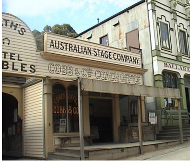
Cobb & Co Coach Office at Sovereign Hill